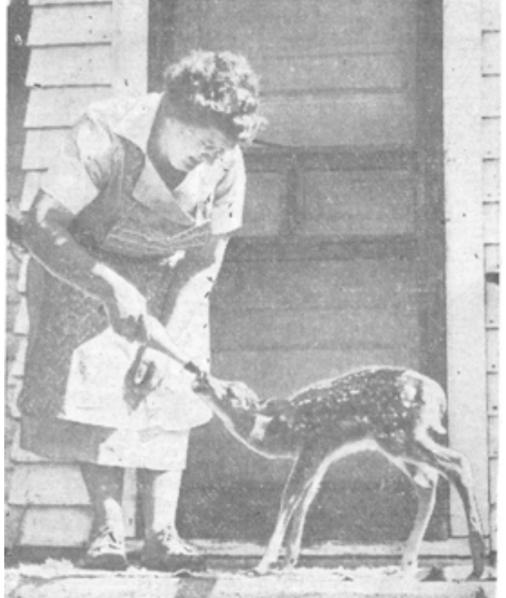
Slug, the deserted fawn, takes a swig.

companionship wjth Tippie, the Boston bull, who gave up his warm bed in the duck-pheasant-turkey hatchery house to sleep in the fawn's private pen; and has had himself adopted by the Glendalough staff. Slug is the youngest member of a herd of 29 deer and a dozen fawns that roam the game preserve, where this year 8,000 wild ducks and 10,000 pheasants are being grown for release next fall.