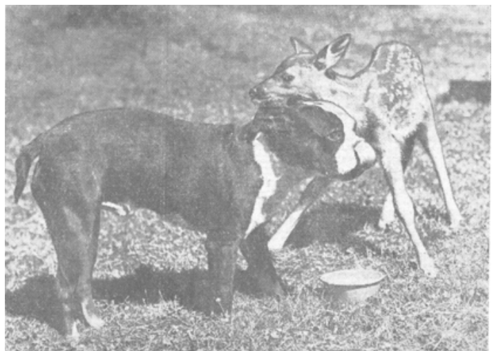
A pair of pals - fawn and Boston bull.